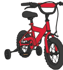
learning to cycle a bike