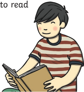
learning to read