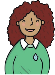
first day of school