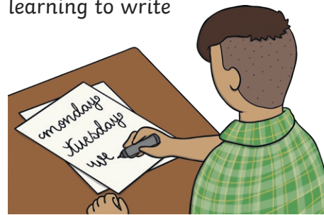
learning to write